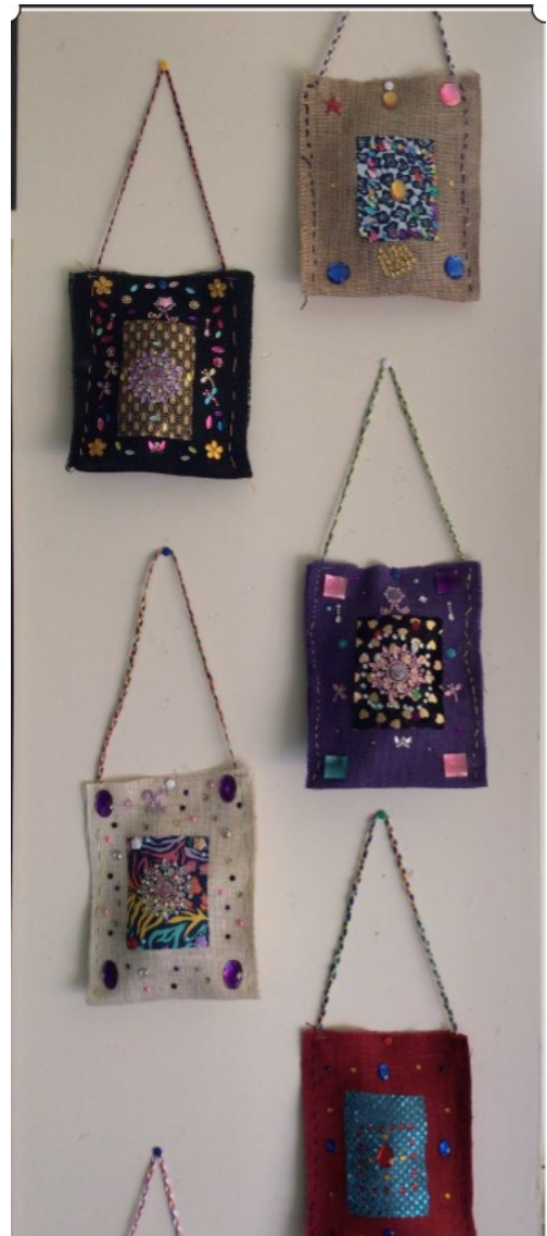
Living and Learning at Herbert Strutt